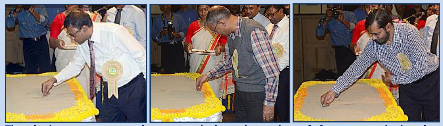
The day's program was inaugurated through sowing of Sesame seeds by the distinguished guests and the President and the General Secretary of SATSA, West Bengal.